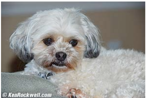
No preflash - eyes open

The 30D, like most cameras, fires a preflash a fraction of a second before the actual photo is taken to set how bright the flash should be. Then it takes the picture a fraction of a second later with a second pop of the flash. Most of the time the first pop of the flash starts people and pets blinking, which almost guarantees that their eyes will be closed in the actual photo!