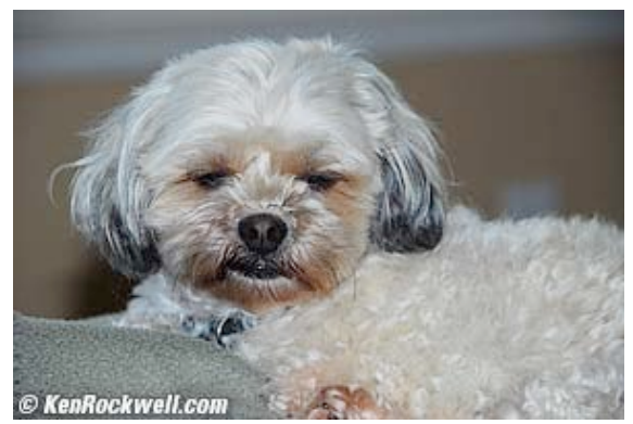
Preflash - Eyes Closed